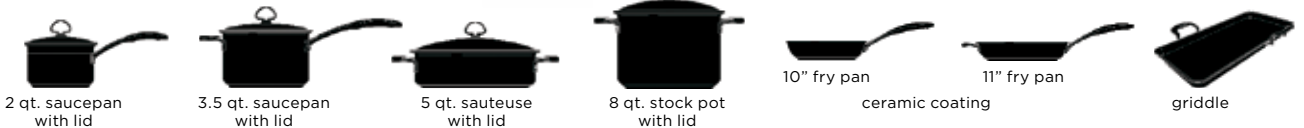
2 qt. saucepan with lid